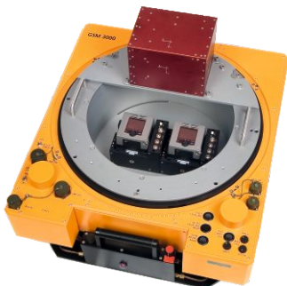
Example of GSM3000 mount with mount adapter, IMU and two digital cameras.

The mount adapter can be loaded with one, two or up to four cameras. All cameras can be controlled and monitored by the DigiControl computer. Likewise, one CCNS4 is enough to trigger all cameras, and by the help of one AEROcontrol the elements of exterior orientation can be determined for all